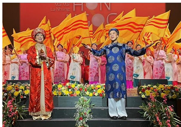
The two alumni emcees led the audience in singing the national anthem of the Republic of Vietnam