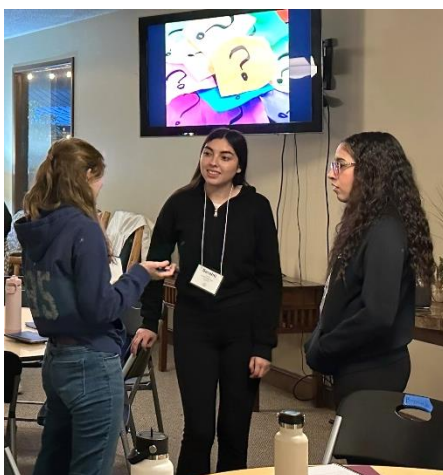
Three participants in the Called & Chosen Retreat for young women in Portland