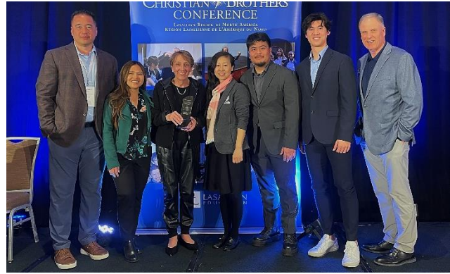
La Salle Pasadena representatives accepted the Brother Michael Collins Award at LASSCA gathering in Anaheim