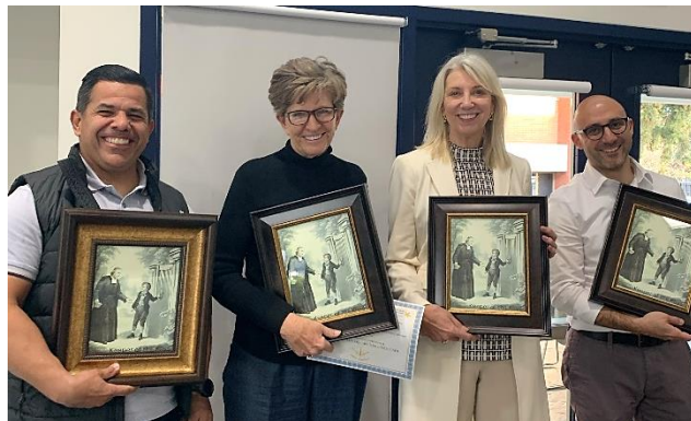
Beaming board chairs from CHSLA, St. Michael's, CBHS, and LaSalle Pasadena with artwork to remind them that they're Keepers of the Keys and treasured Partners in the Mission