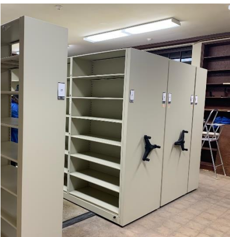
Archives shelves and tracks have been moved into the old novitiate library