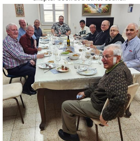
Bethlehem U and St. Joseph in Jaffa communities gathered for Lenten recollection

"You must have a great attention and affection for preserving or procuring the innocence of the children entrusted to your guidance and for keeping them away from whatever might interfere with their education or prevent them from acquiring piety..." Meditations 110.3