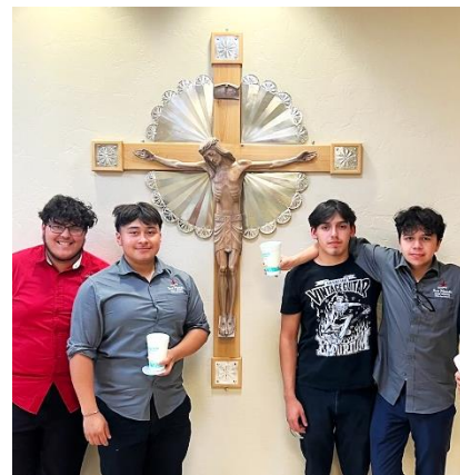
Crucifix which hung in Sangre de Cristo Retreat Center now at San Miguel Tucson