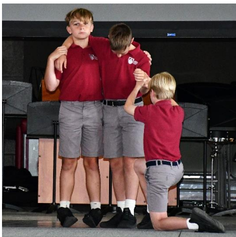
Christian Brothers School City Park students reenacted the Stations of the Cross