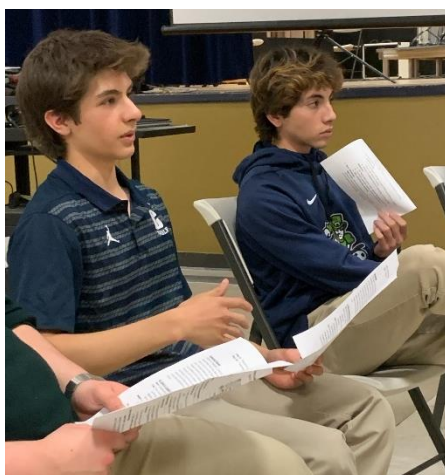
CHSEP students evaluating their most recent El Otro Lado experience for improvement