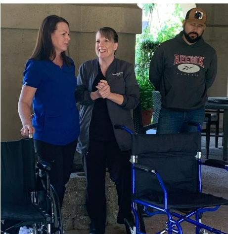
DLSI employees were trained in how to assist with a wheelchair evacuation of HFC