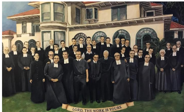
Painting of all the Brothers who have served at Christian Brothers School since it was founded in NO City Park in 1960