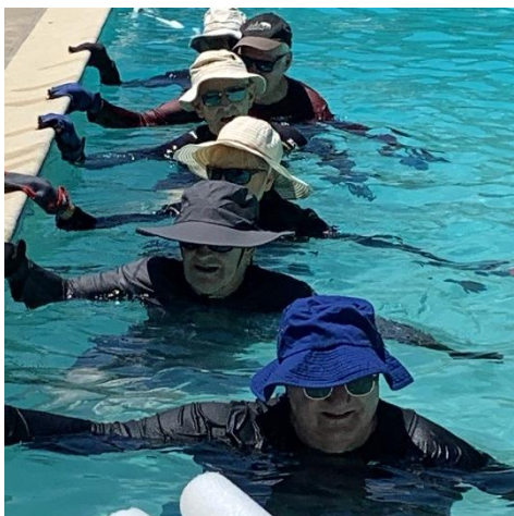
The biweekly Water Aerobics class at the MLS pool continues to grow in membership!