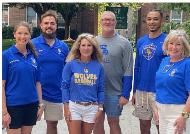
Here are the Saint Paul's School's record six representatives attending the Buttimer Institute this summer