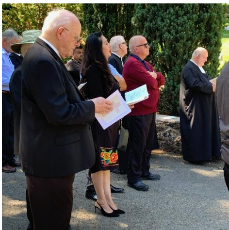
Part of the congregation in prayer during a burial at Mont La Salle's cemetery