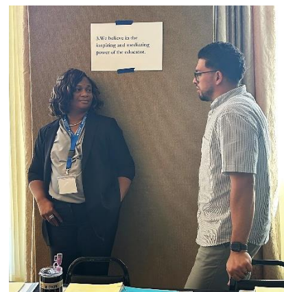
Representatives from DLS New Orleans and San Miguel during trustee training