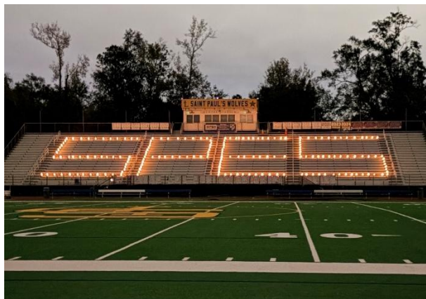
Saint Paul's students shared their Advent message with the Covington community: Hope especially in difficult times