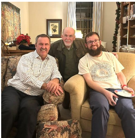
The Yakima community was the only one with 100% representation at the Chapter