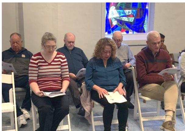
Brothers and DLSI staff joined together for a Holy Week prayer service and luncheon